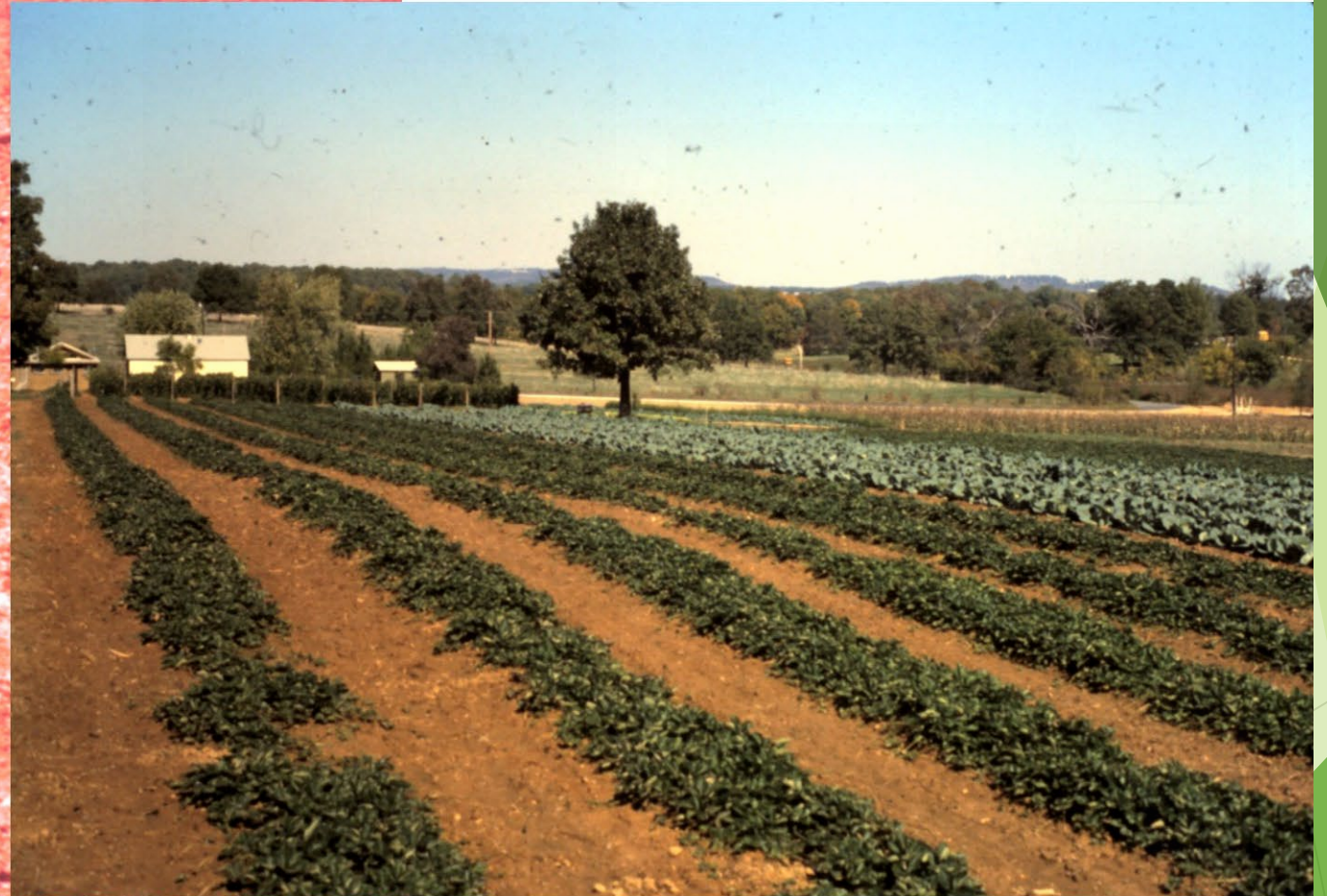
Setting tomatoes, strawberries in matted rows, broccoli nearing harvest